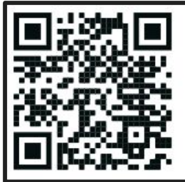
BBC Light Sources