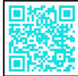
BBC Light and Dark